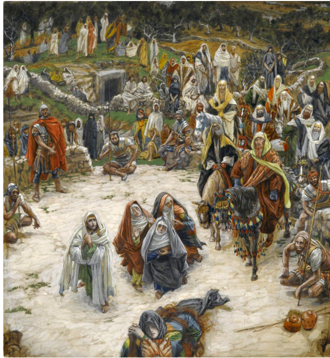
Crucifixion, seen from the Cross by James Tissot, c. 1890.