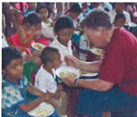
Serving a meal at Loma Linda